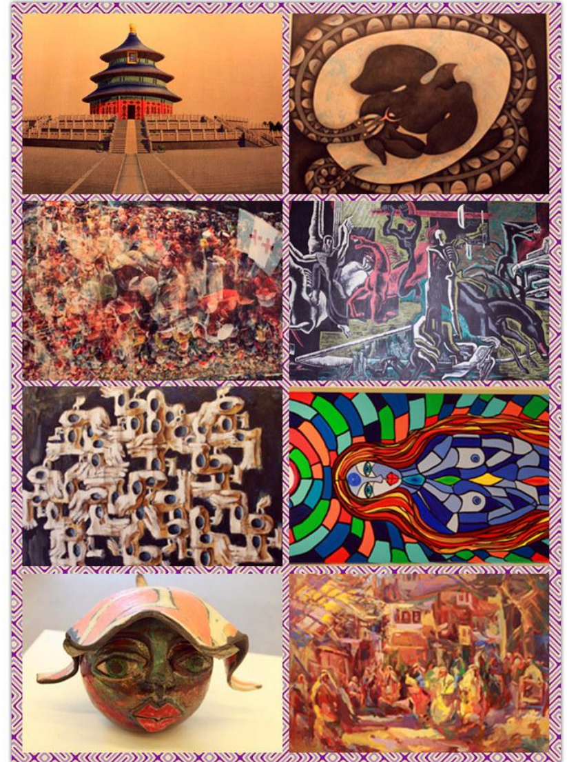
Exhibitions in UN