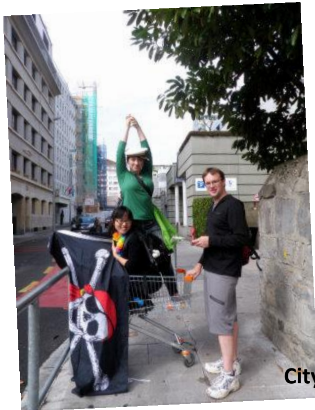
City Scavenger Hunt